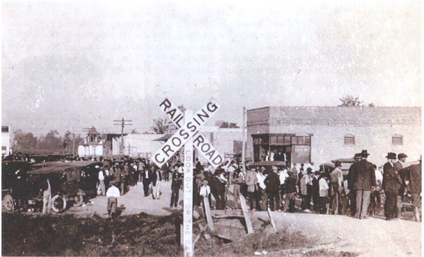
Figure 1: View of Downtown Elaine on October 2, 1919, with the Lee Grocery Store on the right.

Phillips County, Arkansas County and State