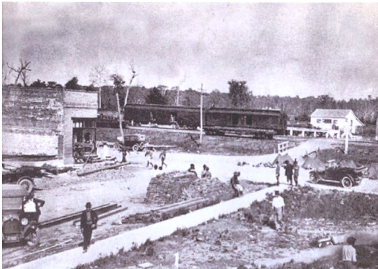
Figure 2: View of Downtown Elaine in October 1919 with the Lee Grocery Store on the left. (From the wayside exhibit in downtown Elaine.)

Phillips County, Arkansas County and State