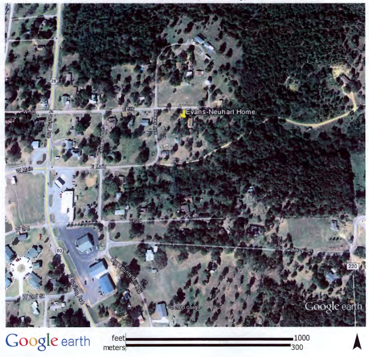
Evans-Neuhart Home, Plainview, Yell County, Arkansas