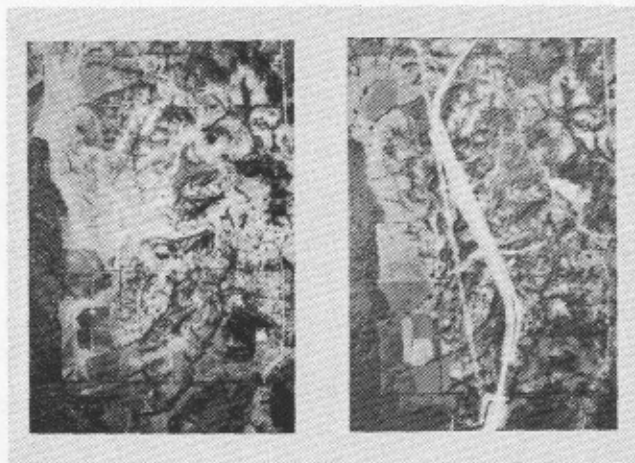
Figure 2. Aerial photos of Saratoga Landing Blackland Prairie area in 1951 (left) and 1964 (right). The area was substantially prairie (grazed) in 1951 and substantially forested in 1964. A powerline and a railroad were built between photographs. Cleared fields to the left are now in Millwood Lake. North is up in both photographs.

In 1939, when the first aerial photographs of the area were taken, the area was still primarily open prairie, with scattered trees over much of the area, and dense forest in parts, primarily along streams. The 1951 aerial photo of the area shows much the same pattern; however, the 1964 photo shows far more forest land than previously (Fig. 2). A