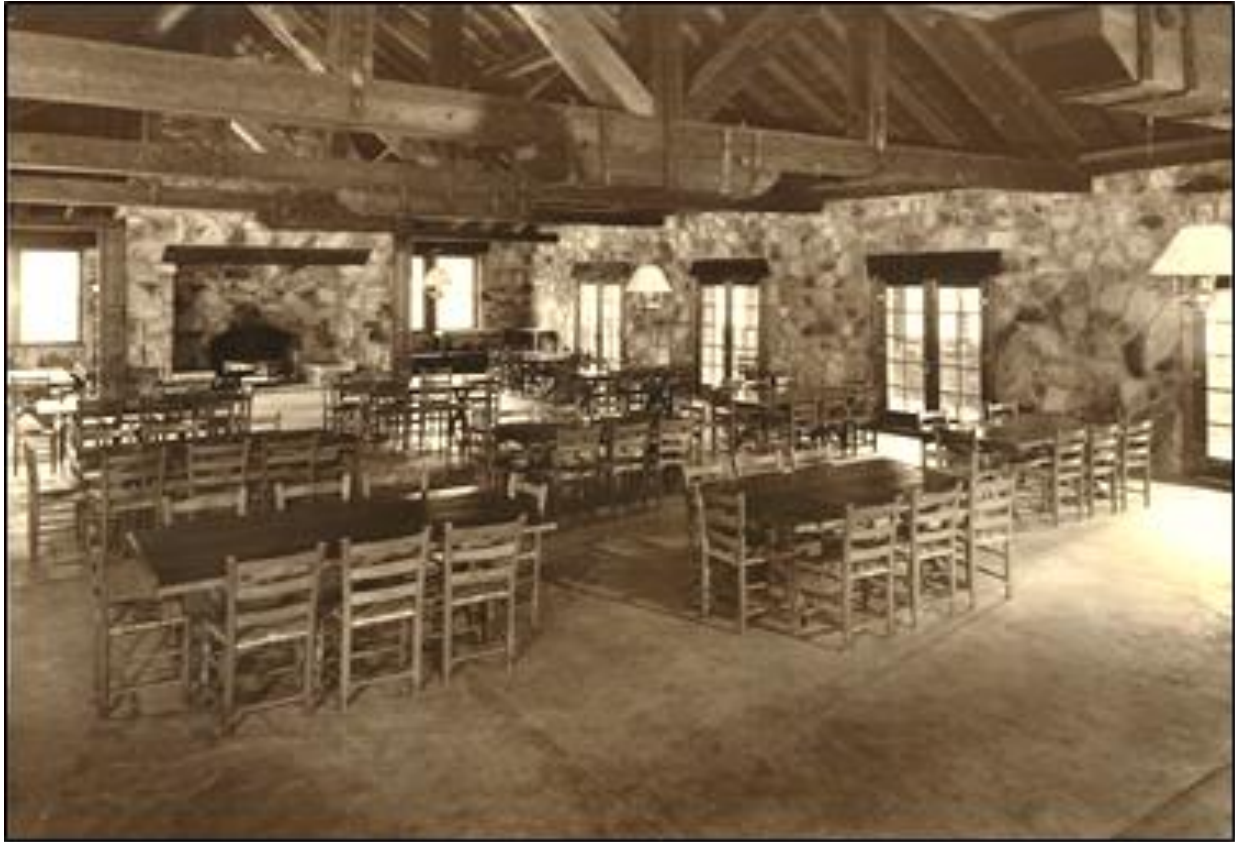
Historic photograph of the interior of the Great Hall at Camp Ouachita. The lamps hanging from the ceiling are kerosene lamps.