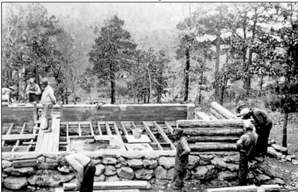
CCC Workers Constructing Mather Lodge, 1935