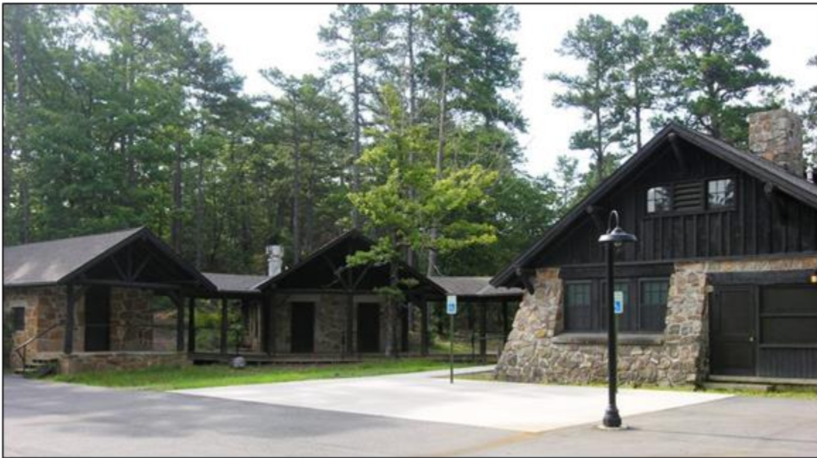
Restored Great Hall (to right) and staff housing at Camp Ouachita