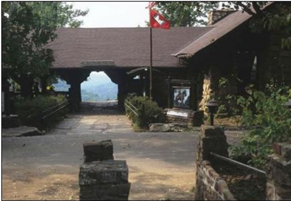
Mather Lodge, 1935

The Mather Lodge was built in 1935 out of stone and logs. The CCC developed the architectural style known as “rustic style.” The buildings utilized the natural resources available in Arkansas for their construction. The lodge now houses the visitor center along with a restaurant and rooms for rent.