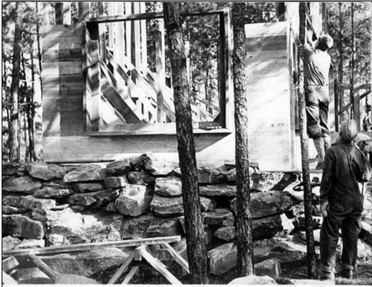
CCC workers building a bridge and cabin at Petit Jean State Park