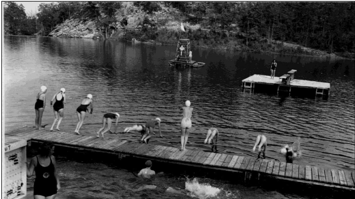
Girls diving off the pier at Lake Sylvia.