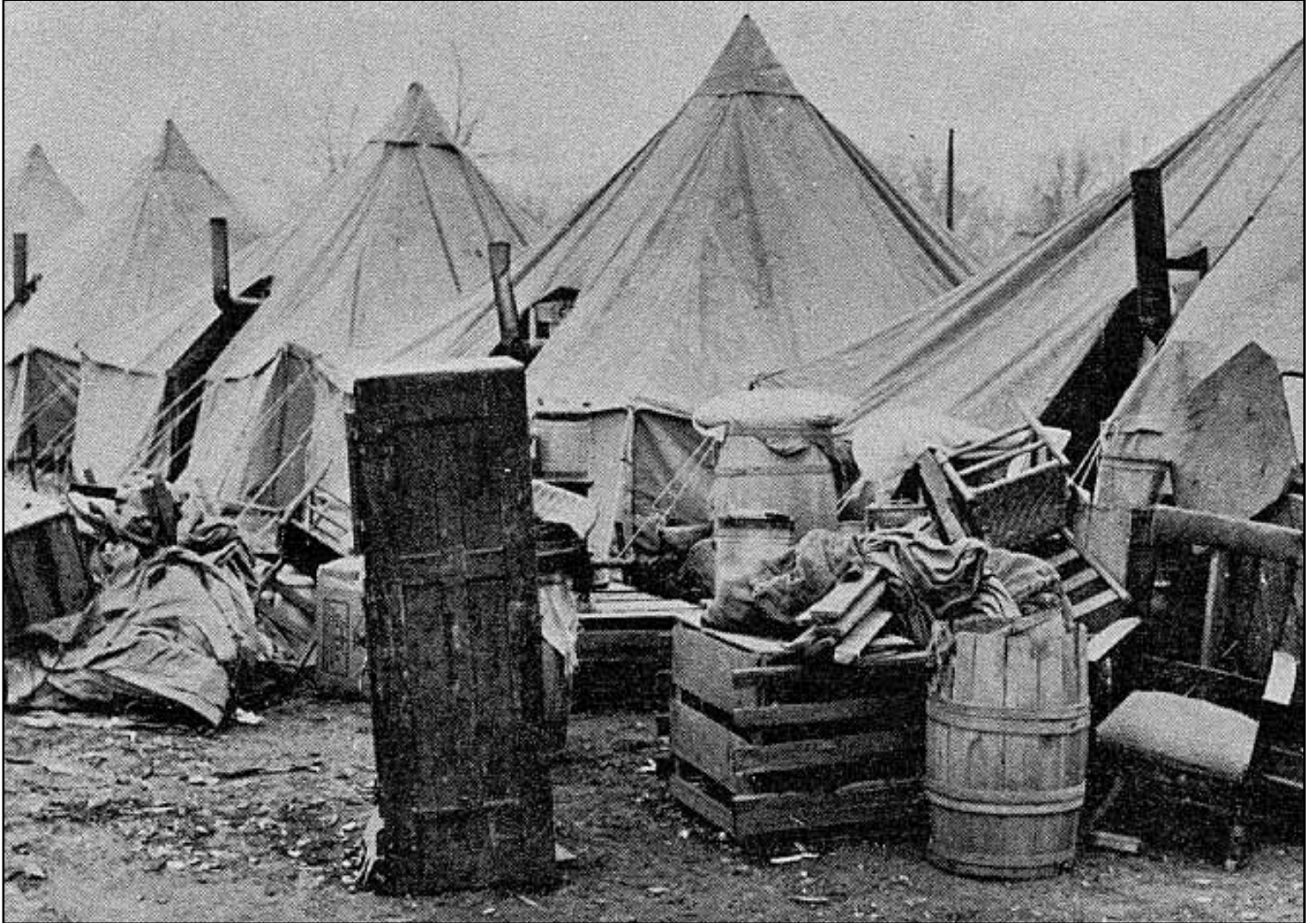
“Tent City” at Forrest City, Arkansas 1930.

Examine the photograph below of the “tent city” or “shantytown” once located outside of Forrest City, Arkansas. These homeless camps were also called “Hoovervilles” after President Herbert Hoover, who supposedly let the nation slide into the Great Depression. Consider what life would have been like living in one of these shantytowns.