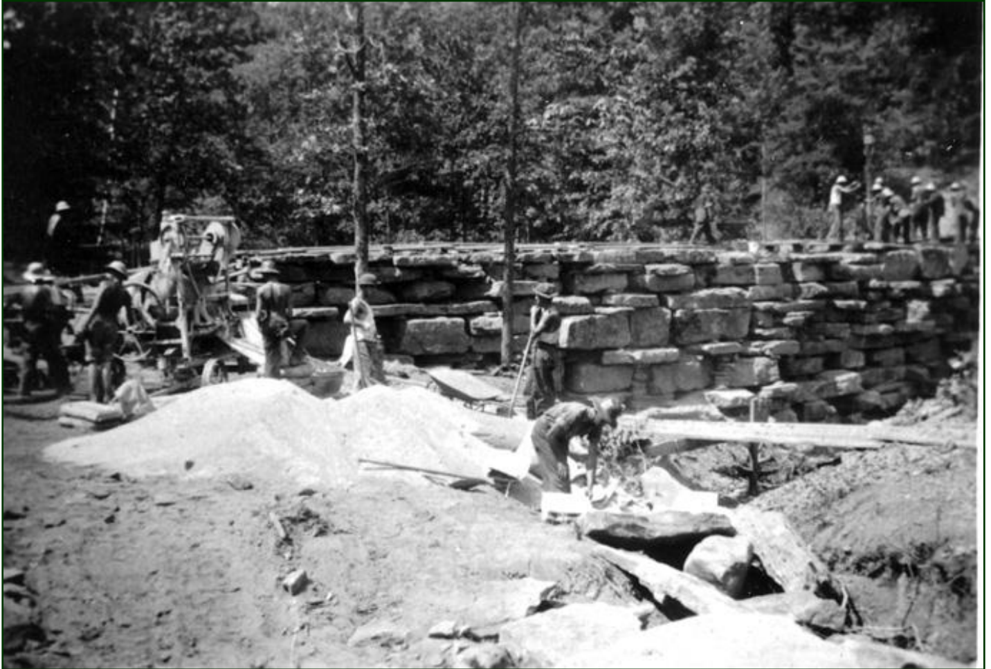
Civilian Conservation Corps (CCC) work crew at Devil's Den State Park, Washington County, 1934